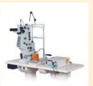
Retina Green Laser